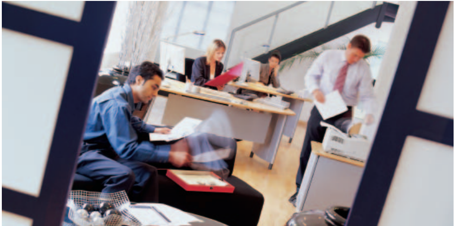
B4350: Reliable, high-speed professional printing for personal and very small workgroup users

The B4250/B4350 have options for networking and upgrades, so you'll find the B4000 Series can be specified to meet your requirements, precisely. Our printers excel in all areas affecting workplace productivity. Choose your printer and its particular benefits based on the specification requirements for your business.